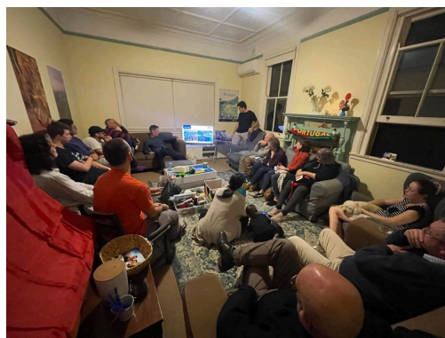
With Joshua Tree Church, Petersham