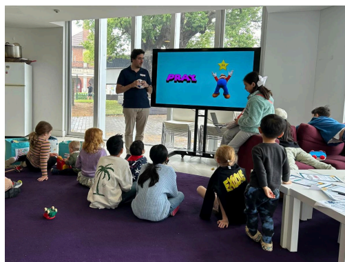
With the kids of Village Church, Annandale