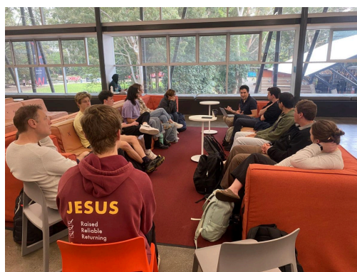
With the Uni Bible Group in Wollongong