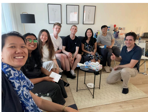
At our first 'drop-in day' in Kings Langley