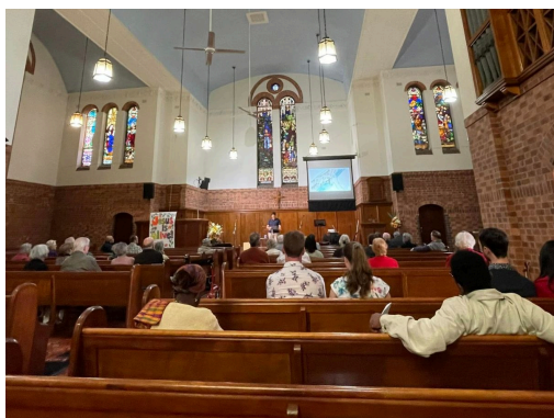
With City Central Presbyterian Church, Wollongong