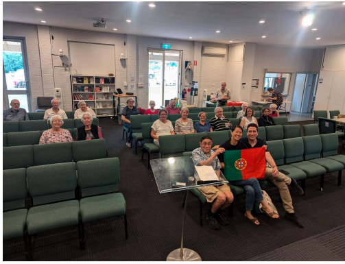
With the retirees group at Toongabie Anglican Church