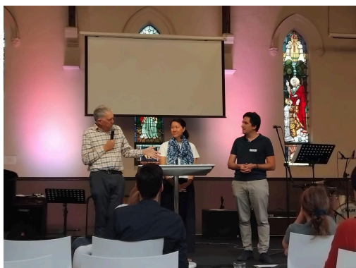
With Village Church, Annandale