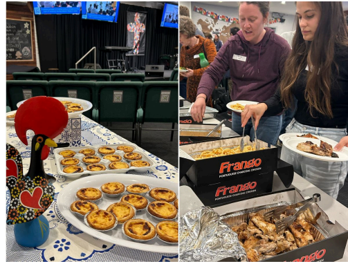
Portuguese tarts and chicken with Toongabie Anglican Church