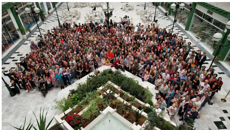
In April we attended a conference in Spain for all ECM missionaries working across Europe (500+ in total). We left refreshed by great teaching from God's word and heartening conversations with fellow missionaries. See if you can find us!