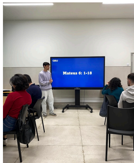
The 6 GBU Coimbra students that wrote and led their own inductive bible study this semester