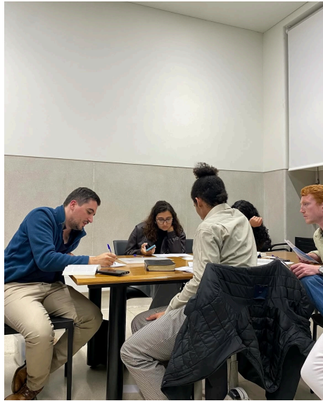
Reading Luke together at one of the GBU Coimbra bible studies