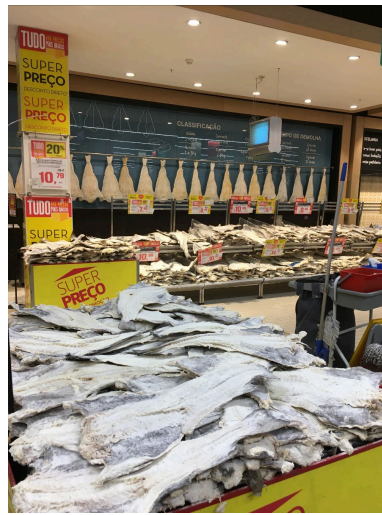
No Portuguese Christmas meal is complete without bacalhau (salted cod). Sold in large, pungent slabs, it's rehydrated and cooked in many ways, often with cabbage and potatoes.