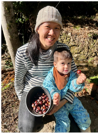
Freshly picked chestnuts from Sam's grandparents' farm! Roasted, they are a classic Portuguese treat this time of year.